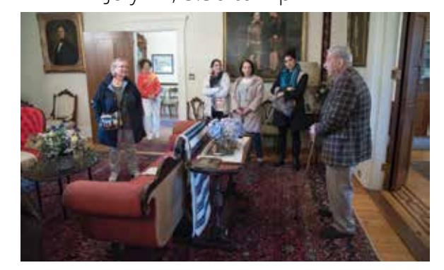
Town Tours & Village Walks July 21, 5:30 to 7 pm

Coatesville Remembers 9/11 September 11, 8:30 to 11 am