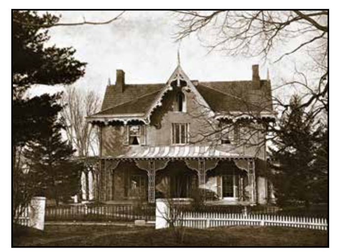
Chester County Day October 1, 10 am to 5 pm

Coatesville Remembers 9/11 September 11, 8:30 to 11 am