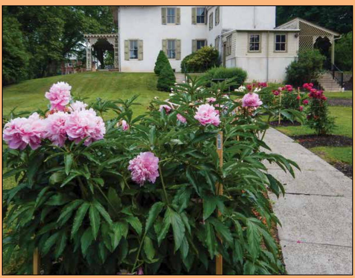
The annual flowering of the Peony Walk behind Terracina is an event visitors look forward to each year.